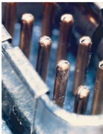
Photograph showing white powder contamination on pins.

In this example, a white powder was observed on electrical pins. The powder was removed and analyzed using FTIR. The spectrum of the powder matched a reference spectrum from a solder flux sample, indicating that the flux was the source of the contamination.