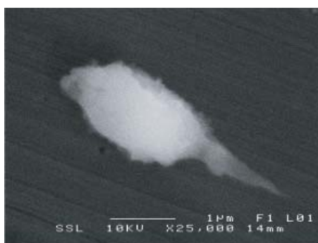
SEM image of particle found on surface

In this example, a particle that was approximately 1 \mu\text{m} in diameter was found on a surface. Raman analysis of the sample indicated that it was composed of polyethylene.